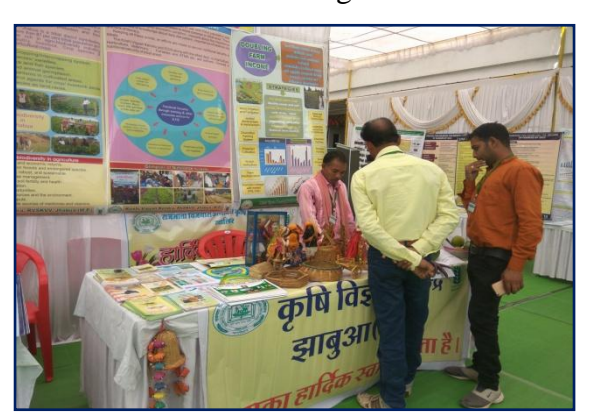
Exhibition of KVKs from Madhya Pradesh, Chhattisgarh and Odisha