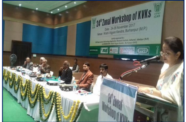
Address by the Chief Guest Smt Archana Chitnis, Hon'ble Minister for Women and Child Development, M.P. Govt

In inaugral addresss Chief Guest Smt Archana Chitnis, Hon'ble Minister for WCD, MP emphasised upon the nutritional secruity and advised to have a focus on the integrated farming system, develop cropping plan etc. keeping in view the nutritional secruity of the family. Integrating farming system with focus on diversification through horticulture and livestock is needed for income enhanment of farmers. She also suggested the farmers to adopt